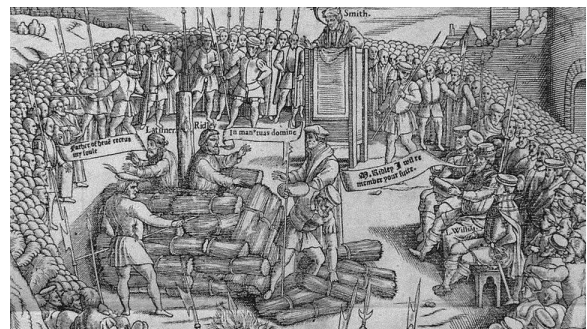
A woodcut depicting the Oxford Martyrs.

Cramer was one of the three the Oxford Martyrs who were tried for heresy by Queen Mary in 1555 and subsequently burned at the stake for their religious beliefs and teachings. The other martyrs were the Anglican bishops Hugh Latimer and Nicholas Ridley. The martyrs were burned at the stake just outside the city walls to the south, where the city's Broad Street is located. It is claimed that the scorch marks from the flames can still be seen on the doors of nearby Balliol College.