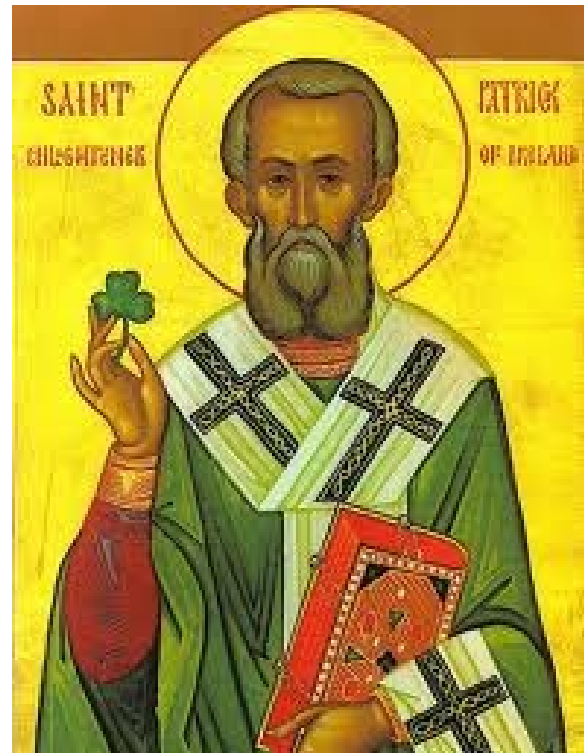
St. Patrick's Feast Day is observed on March 17

Since around the ninth or tenth century, people in Ireland have been observing the Roman Catholic feast day of St. Patrick on March 17. Interestingly, however, the first parade held to honor St. Patrick's Day took place not in Ireland but in the United States. On March 17, 1762, Irish soldiers serving in the English military marched through New York City. Along with their music, the parade helped the soldiers reconnect with their Irish roots, as well as with fellow Irishmen serving in the English army. Over the next 35 years, Irish patriotism among American immigrants flourished, prompting the